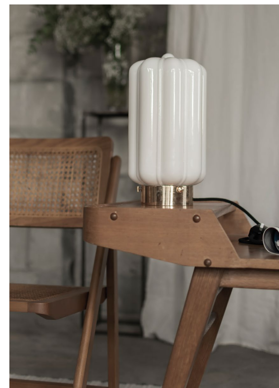
Table Lamp Opaline Deco is addressed to all those who value sophisticated and well-designed interiors with a hint of Art Deco.

Glass Table Lamp Opaline Deco is an elegant combination of a traditionally hand-blown glass lampshade of a milky colour with a stable modern base made of brass. The elongated lampshade with an intriguing, although not immediately obvious, cross-section of a flower, combines the typical Art Deco floral inspiration with a passion for geometrical form.